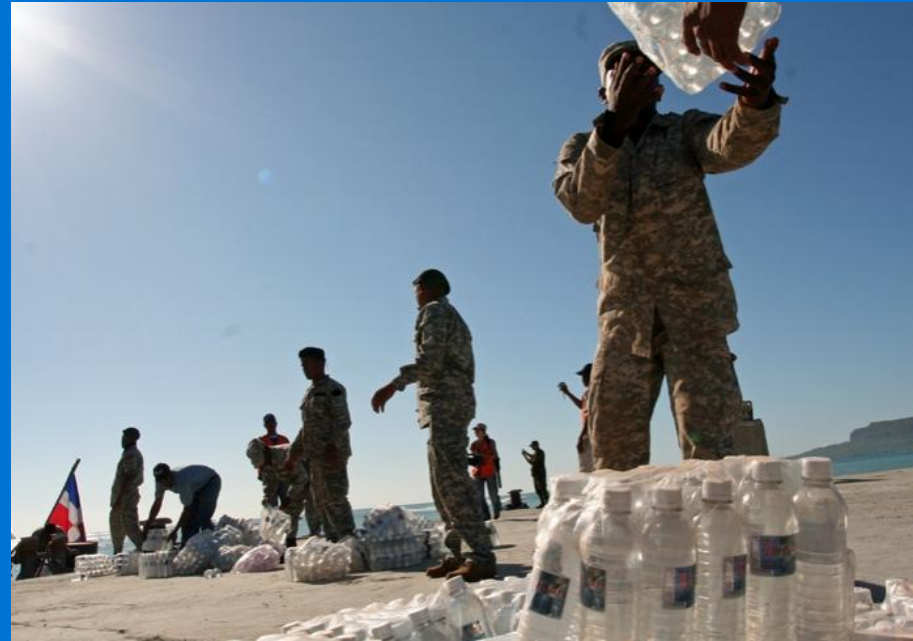
Soldiers helping Plan ship in aid, including water, to the camps.

Even before the earthquake, Haiti was one of the most difficult places in the world to get clean drinking water.