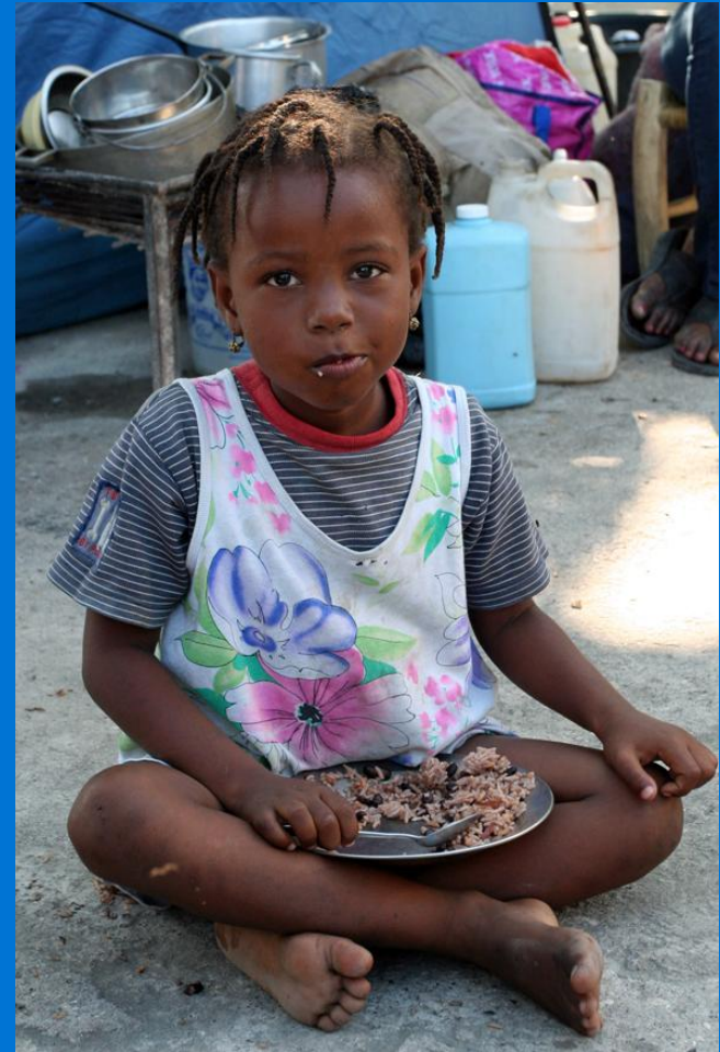
A girl eating food at a Plan supported camp in Jacmel.

After the earthquake, aid organisations began distributing thousands of food packages, but most of the population still suffers from hunger.