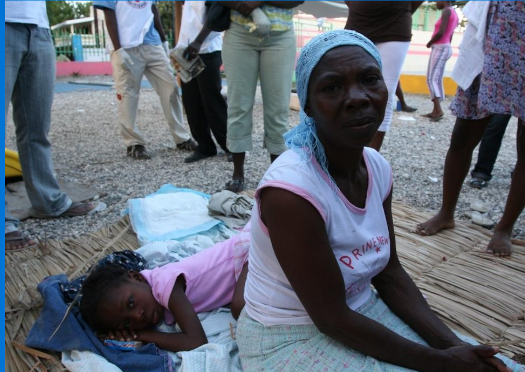
Mother and child sit on mat outdoors following earthquake.

The earthquake destroyed most of the hospitals, medical centres and pharmacies.