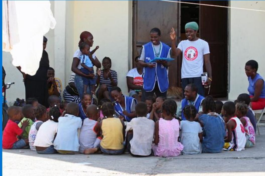
Kids playing games to help them recover from the shock of the earthquake.

An estimated 5000 – 8000 schools and 1.8 million school-age children have been affected. Returning to a regular routine is an important part of the healing process for affected children.