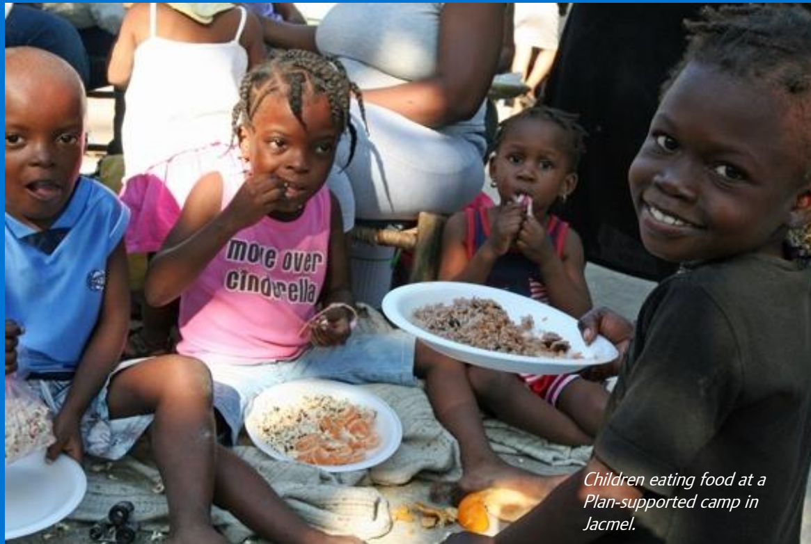
Children eating food at a Plan-supported camp in Jacmel.