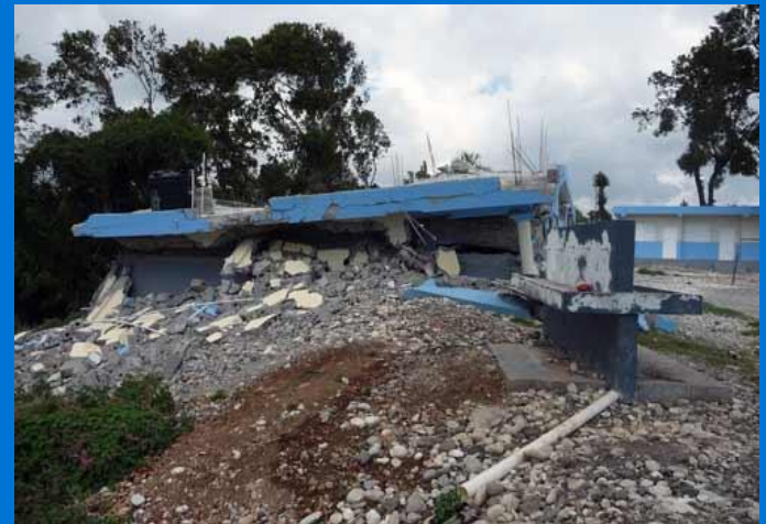
A Plan funded preschool that collapsed as a result of the earthquake