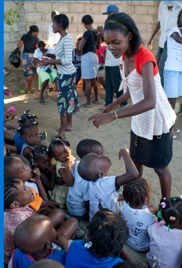
Kids playing games to help them recover from the shock of the earthquake.

Providing emotional support for communities is very important.