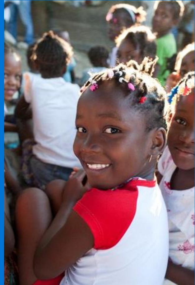
Children playing games to help recover from the earthquake.

SchoolAid provides you with a Project Planning Toolkit to help you hold great fundraising events, and online resources so you can learn more about taking action.