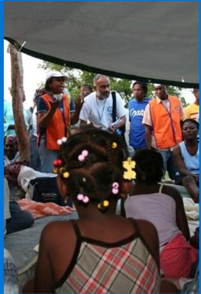
Plan staff conducting assessments to meet urgent needs in camps.

As a result of the earthquake, about 1 million people lost their homes, belongings and sometimes their friends and family members. Many survivors are now living in emergency shelters.