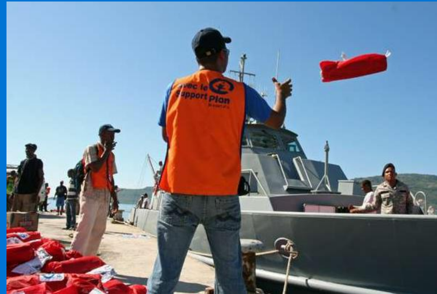
Plan distributing tents in camp set-up for people made homeless by the earthquake in Jacmel.

Large tent shelters to resume education for approximately 30 children.